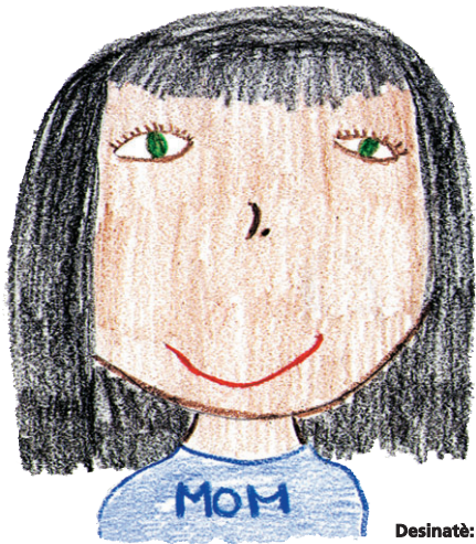
Desinatè: DeSouza, 11 an