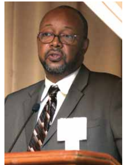
Leonard Pitts Jr.