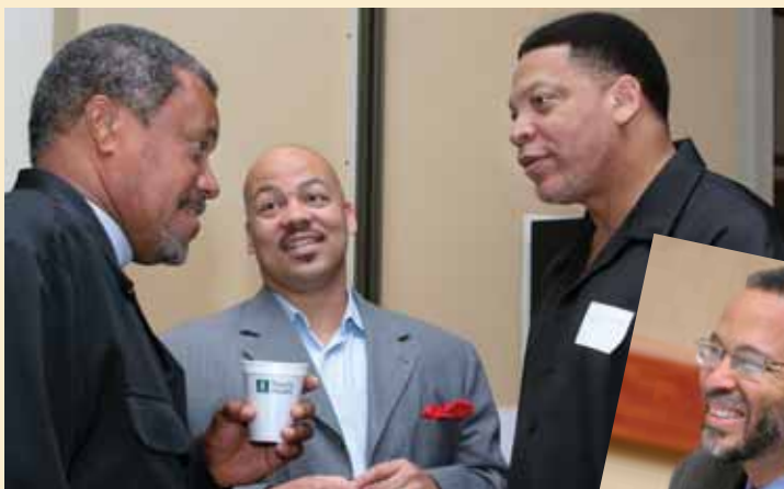
Faith-based conference attendees.

More than 50 members of the faith-based community came together at the Baptist Hospital auditorium on April 13. The meeting was a follow-up to the Silence the Violence initiative started by The Melissa Institute last fall. The religious leaders discussed strategies to reduce violence.